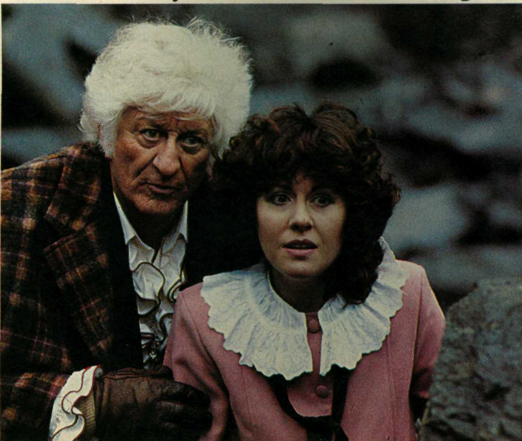
Third Doctor Jon Pertwee and companion Elisabeth Sladen

second Doctor and Jamie after the Space Wheel on which she was based was attacked by Cybermen and Cybermats. Like Jamie, Zoe was also returned to her own time by the Time Lords with only the memory of