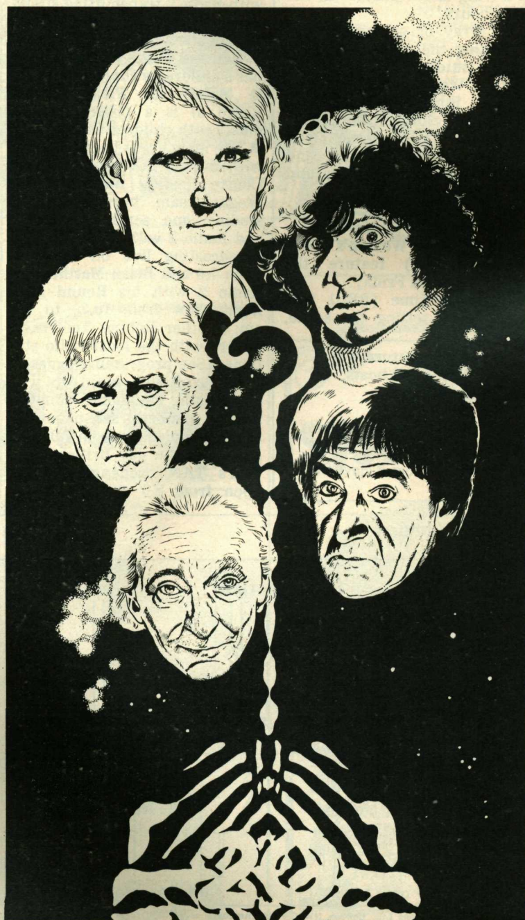
The Doctors (clockwise): Peter Davison, Tom Baker, Patrick Troughton, William Hartnell and Jon Pertwee

century Earth, but we learned they had landed on many, many planets between leaving Gallifrey and landing. Susan joined a school, and after two of her schoolteachers had