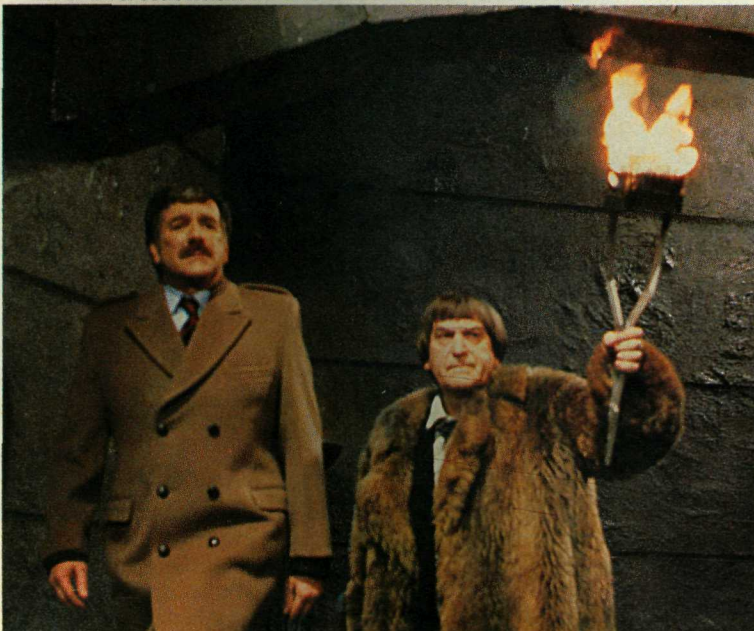
Nicholas Courtney with second Doctor Patrick Troughton