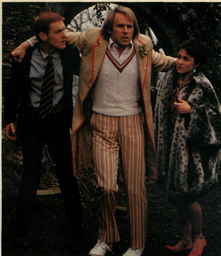
Peter Davison with Mark Strickson and Janet Fielding

have been three versions. The first was built by Professor Marius while he was stationed on the Bi-Al foundation, located in the asteroid belt, in AD 5000. He bequeathed it to the fourth Doctor and Leela. When Leela remained on Gallifrey to marry