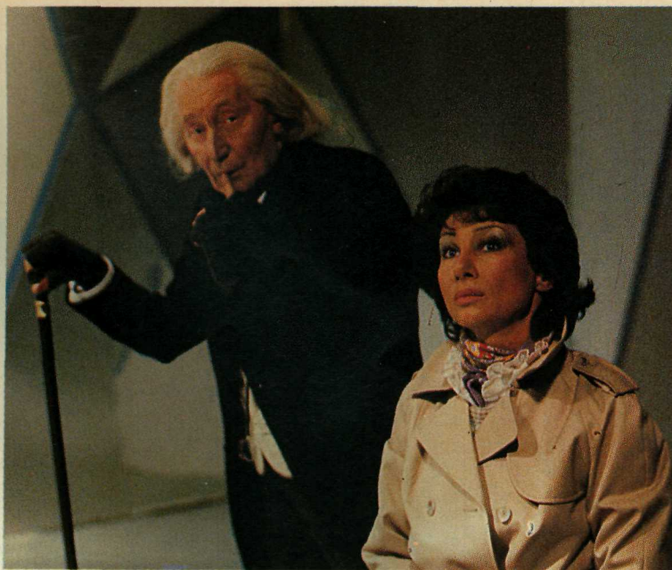
Richard Hurndall as the first Doctor with Carole Ann Ford

Zoe Herriot was a brilliant astrophysicist who joined the