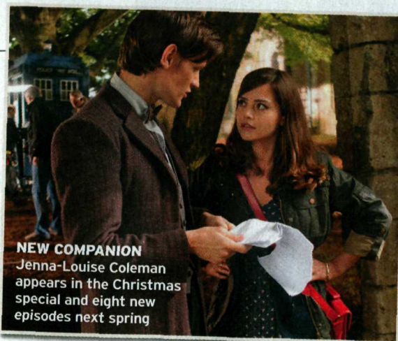
NEW COMPANION Jenna-Louise Coleman appears in the Christmas special and eight new episodes next spring

KAREN I've met Jenna and we get on really well. And I've been texting her bits and bobs about Matt, but what I wrote is a secret. That's the code of the companion. I didn't offer her