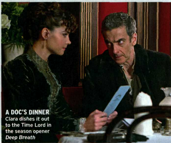
A DOC'S DINNER Clara dishes it out to the Time Lord in the season opener Deep Breath

She hedges a little. "Well, we do see her beginning to fall for Danny," she says cautiously. "The series shows her trying to balance this double life and trying to travel with the Doctor while also being a completely normal human being at home. We see the control freak in Clara. She says she'll travel with the Doctor but only if he drops