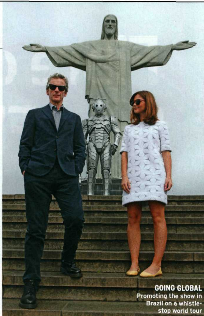
GOING GLOBAL Promoting the show in Brazil on a whistle-stop world tour

The part seems to be a little meatier this series as well – she's stronger, making decisions, taking control, no? "It's more that you're finally getting to know her," insists Coleman. "Initially we couldn't know too much about her because the Doctor was trying to figure her out. Now we're exploring her school and home life. We're just getting to see a lot more of her."