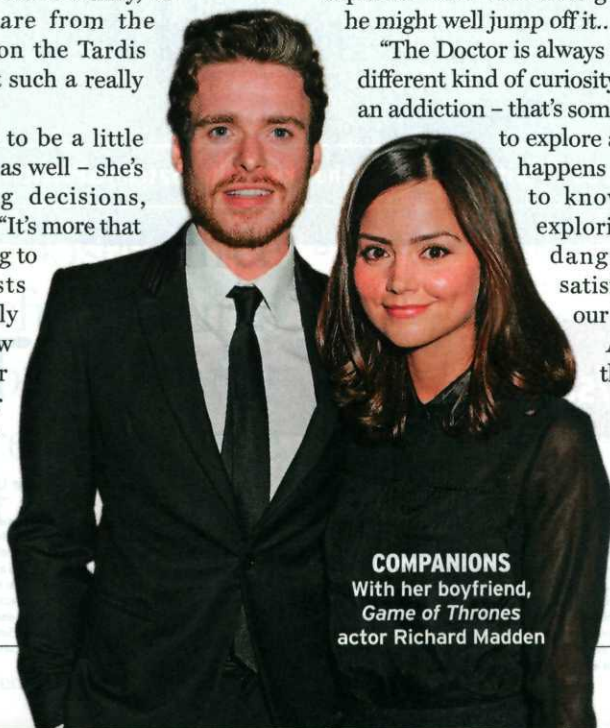
COMPANIONS With her boyfriend, Game of Thrones actor Richard Madden