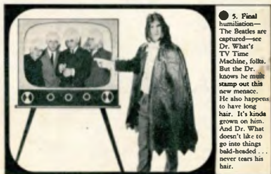
● 5. Final humiliation—The Beatles are captured—see Dr. What's TV Time Machine, folks. But the Dr. knows he must stamp out this new menace. He also happens to have long hair. It's kinda grown on him. And Dr. What doesn't like to go into things bald-headed . . . never tears his hair.