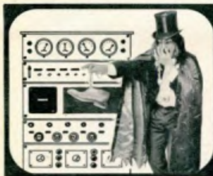
● 2. Before the four explorers can travel on, Dr. What has to find a mechanical fault blocking the thermo-nuclear reactor inside his space craft. (Cue!) He soon does this but gets the boot in the process. He's always putting his foot in it. What you might call "sole" singing.