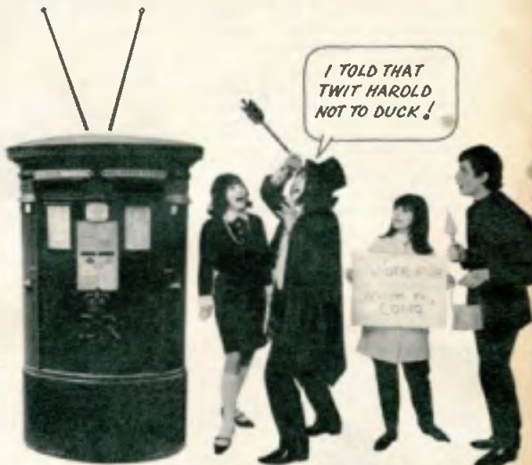
● 1. Dr. What and his friends have just returned in their time machine (cunningly disguised as a pillar-box) from a trip to the year 1066.