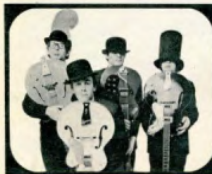
● 4. Many famous groups are forced to wear head-gear to cover their baldness. But hats off to The Zombies—they put the lid on their problem. The Animals have to consult the R.S.P.C.A. for advice. Then Wayne Fontana takes for his motto the ancient saying: "Baldness be my friend."