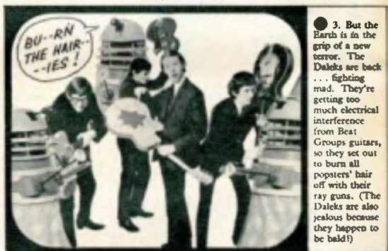
● 3. But the Earth is in the grip of a new terror. The Daleks are back . . . fighting mad. They're getting too much electrical interference from Beat Groups guitars, so they set out to burn all popsters' hair off with their ray guns. (The Daleks are also jealous because they happen to be bald!)