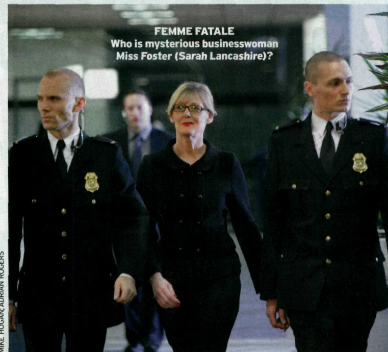
FEMME FATALE Who is mysterious businesswoman Miss Foster (Sarah Lancashire)?

But thank God, we decided to risk it, and actually asked. And Catherine said yes! Immediately! And her performance is just dazzling. After Rose plucked our heartstrings, and Martha's love went unrequited, it's wonderful to have a companion who isn't interested in the Doctor in that way – she's a friend, an equal and a conscience, and I swear she will break your heart.