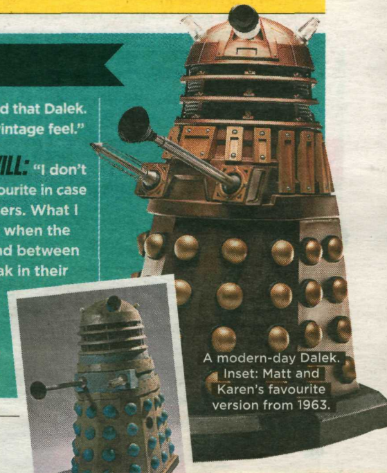
A modern-day Dalek. Inset: Matt and Karen's favourite version from 1963.

ARTHUR DARVILL: "I don't like to pick a favourite in case I offend the others. What I do find funny is when the Daleks sit around between shots, they speak in their regular voices. It's as if when the Doctor's not around, they can all talk normally!"