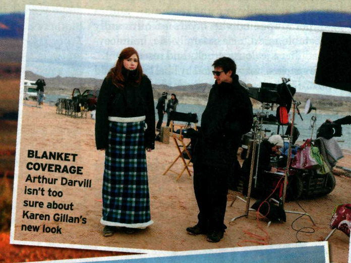
BLANKET COVERAGE Arthur Darvill isn't too sure about Karen Gillan's new look

Darvill also plays guitar and piano and has supported Fyfe Dangerfield of Guillemots on tour. Given these talents (and Katherine Jenkins in last year's Christmas special), is the series inching towards a Buffy -style all-musical episode? "We keep joking about it actually. It's fun occasionally to just rehearse the lines as a musical!" And what's Karen's voice like, we wonder? "Piercing." JN