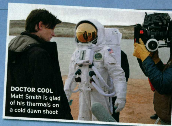
DOCTOR COOL Matt Smith is glad of his thermals on a cold dawn shoot

Is there a certain amount of schadenfreude, watching him waist-deep in Lake Powell? Well of course there is! You're always thinking, "Thank God it's not me wading into that freezing lake at six in the morning"... until you see it on screen, that is, and think, "Oh, wow, that would have been totally worth it." It's tough,