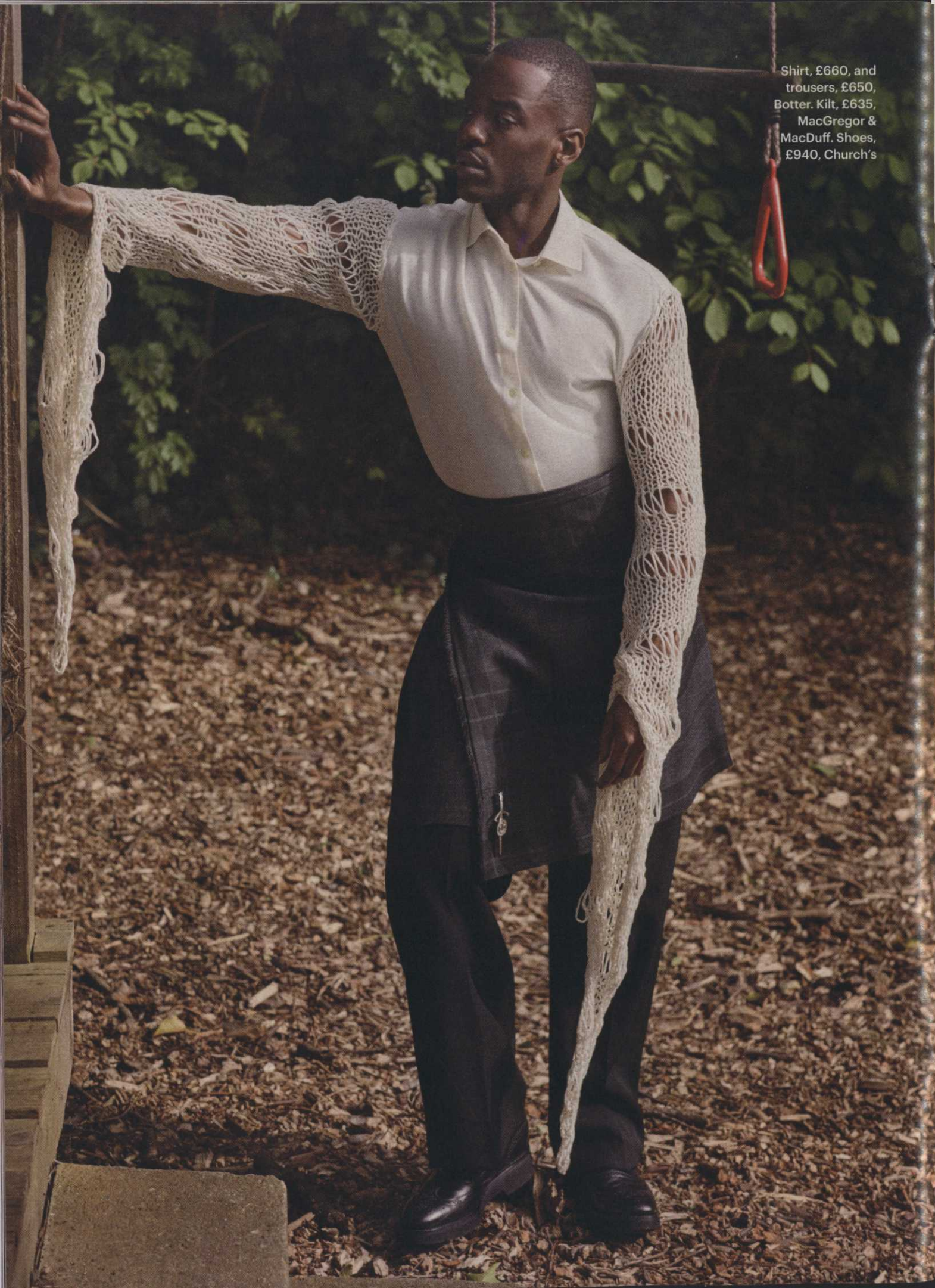
Shirt, £660, and trousers, £650, Botter. Kilt, £635, MacGregor & MacDuff. Shoes, £940, Church's