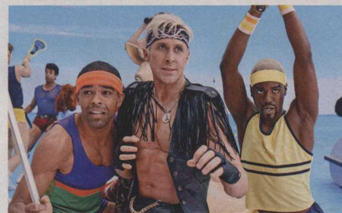
From top Gatwa with Asa Butterfield in Sex Education ; with fellow "Kens" Kingsley Ben-Adir and Ryan Gosling in Barbie ; and as the Doctor, in the Tardis, with Millie Gibson as his assistant, Ruby Sunday

says. The group performance was more than "kenough" to steal the show — it quickly went viral. Even Steven Spielberg stood up and applauded in the Dolby Theatre.