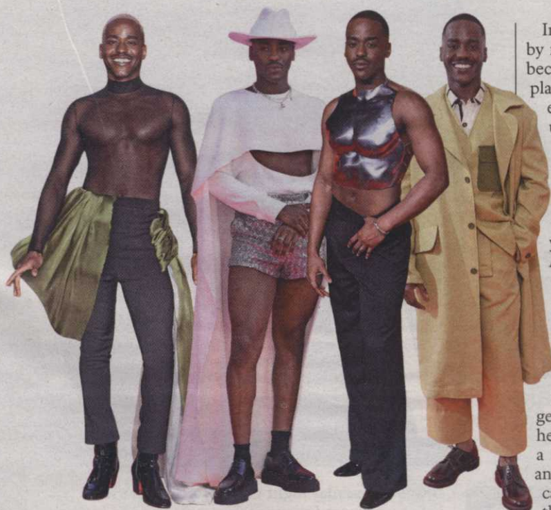
Gatwa's full-throttle fashion is always a red carpet highlight

BBC have] been very protective," Gatwa says. "They were like, 'We're gonna walk you through the whole Comic Con world slowly and get you used to it.'"