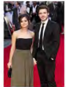
Jenna-Louise and Richard Madden at the Titanic 3D premiere in 2012

Doctor Who starts on 30 March on BBC One