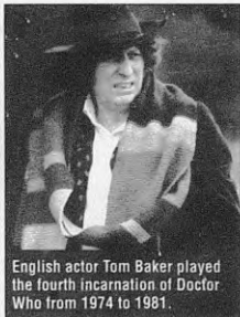
English actor Tom Baker played the fourth incarnation of Doctor Who from 1974 to 1981.