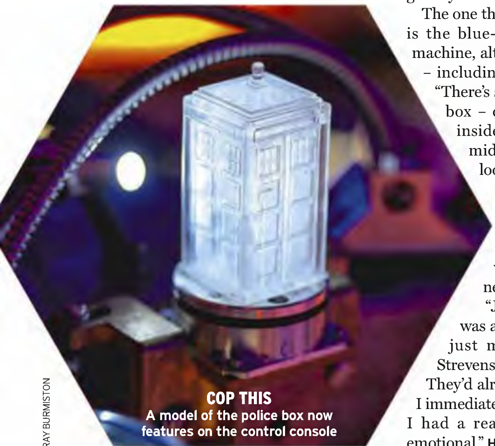
COP THIS A model of the police box now features on the control console

"My favourite thing about it is the movable walls and panels. They seem very futuristic and give it a feng shui sort of vibe. I don't know why they move, they just do! They're like computer screensavers, they keep changing, and I feel totally hypnotised by them."