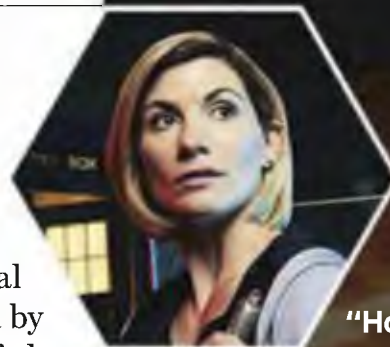
JODIE WHITTAKER The Doctor