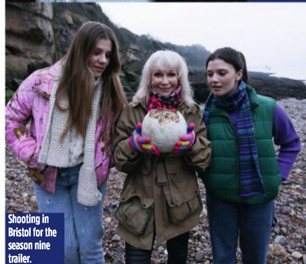
Shooting in Bristol for the season nine trailer.