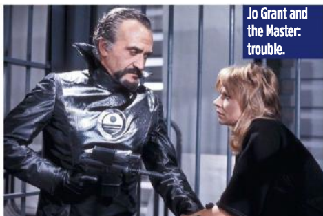
Jo Grant and the Master: trouble.

Doctor Who: The Collection Season Nine is out on Blu-ray now.