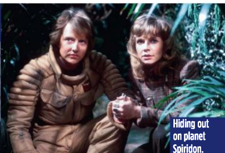
Hiding out on planet Spiridon.