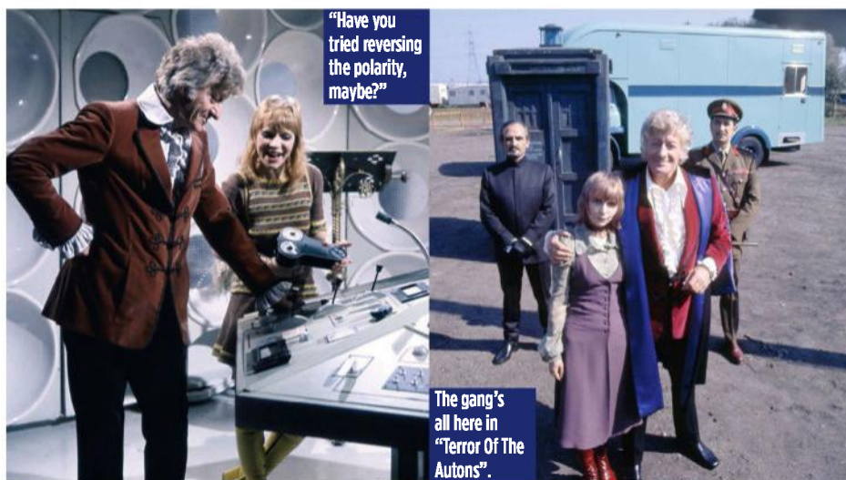
"Have you tried reversing the polarity, maybe?"