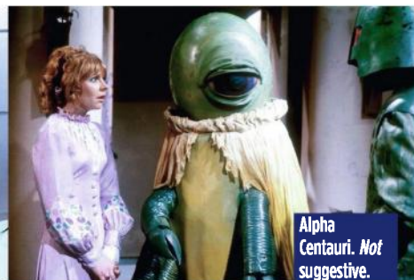
Alpha Centauri. Not suggestive.