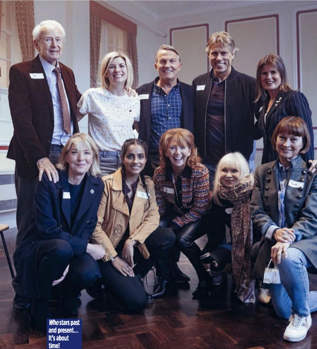
Who stars past and present... It's about time!