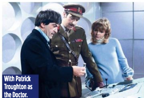
With Patrick Troughton as the Doctor.