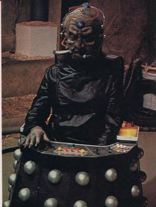
Left: The Doctor finds himself in the clutches of a Mandrel in "The Nightmare of Eden." Above: Davros returns in "The Destiny of the Daleks." Below: Romana and the Doctor try to rescue some young people from "The Horns of Nimon."