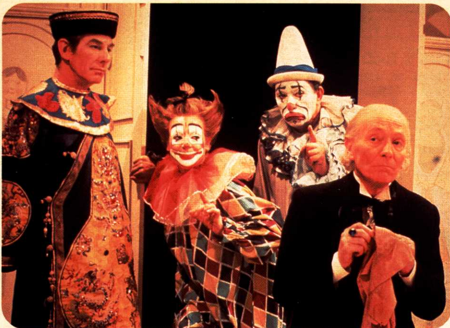
1. (Above) In the beginning there were clowns and panto Chlnamen - and crusty old William Hartnell pitting his wits against baddies wielding hand-whisks and plumbers' plungers.