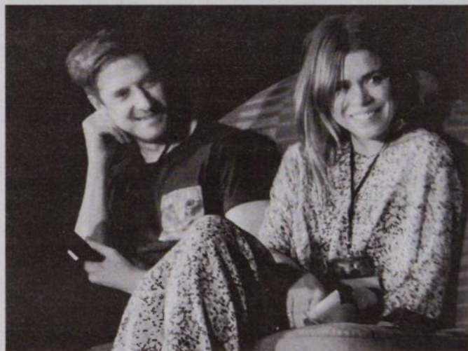
Arthur Darvill and Billie Piper, or better known as the companions Rory Williams and Rose Tyler, attend a panel at Gallifrey One.